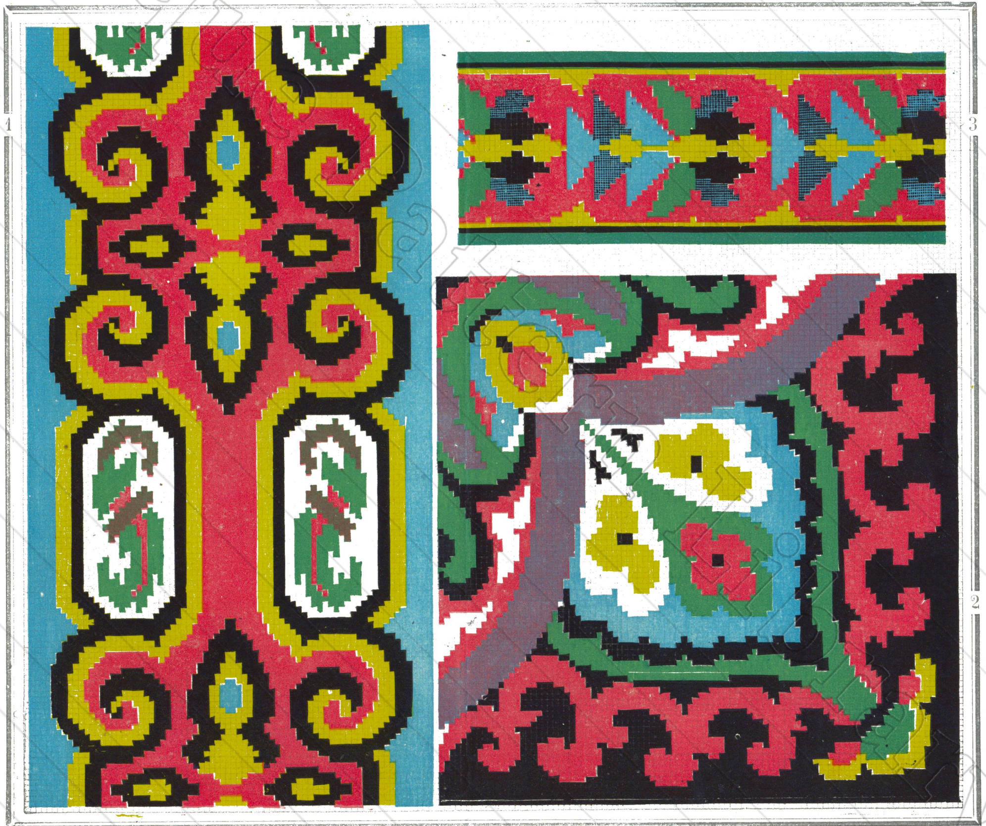
(66) Planches et impression des Couleurs par les procédés typographiques d'Ernest Meyer, 5, rue de l'Abbaye, à Paris.