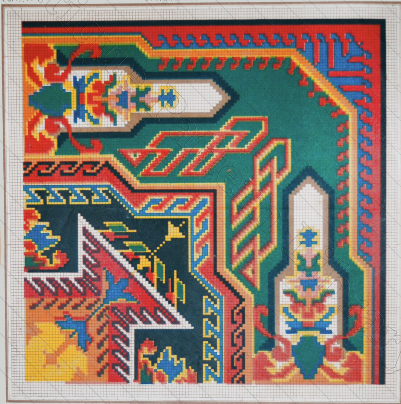
1 Boulevard des Italiens