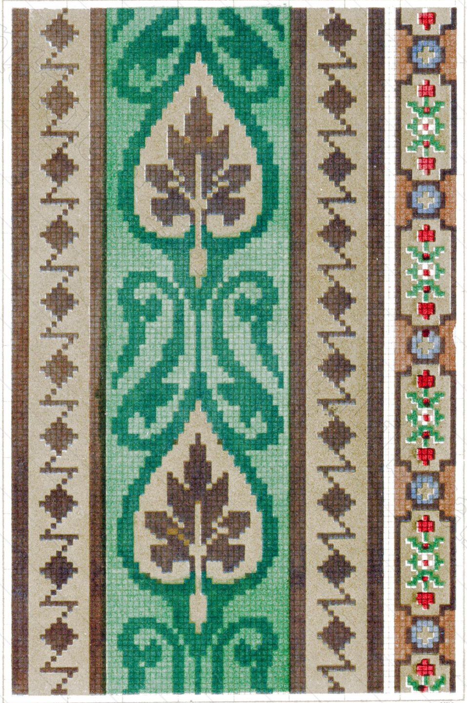
Bureaux de MAGASIN DES DEMOISELLES , PARIS, Rue La Fayette 51