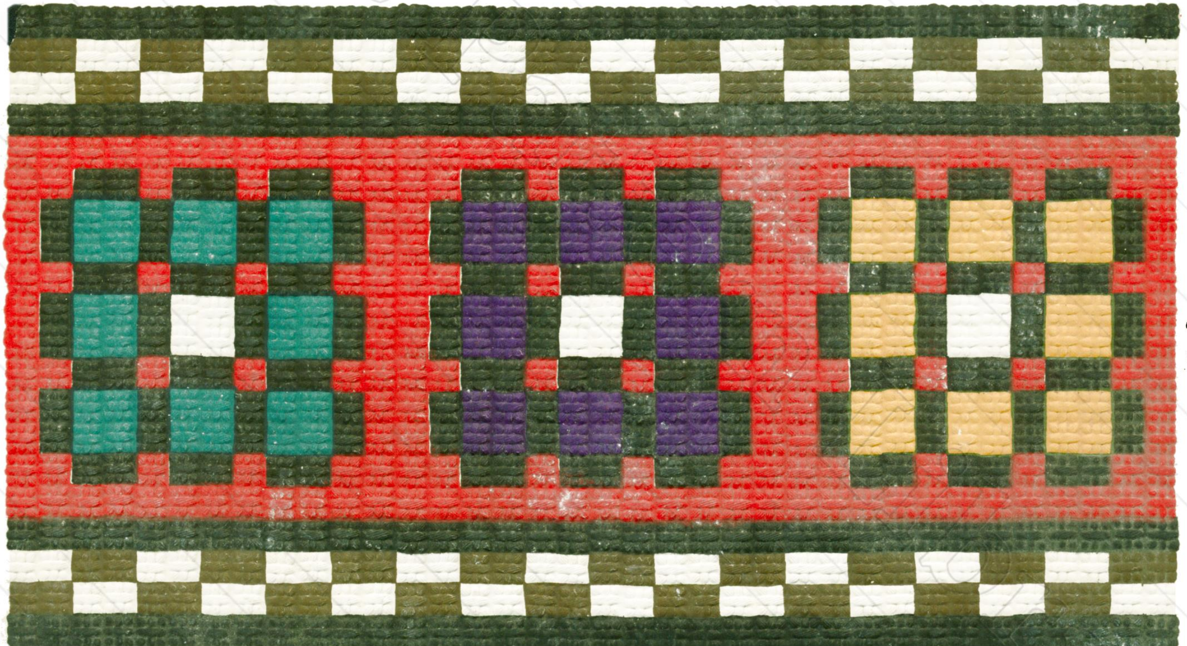
I. Boulevard des Italiens