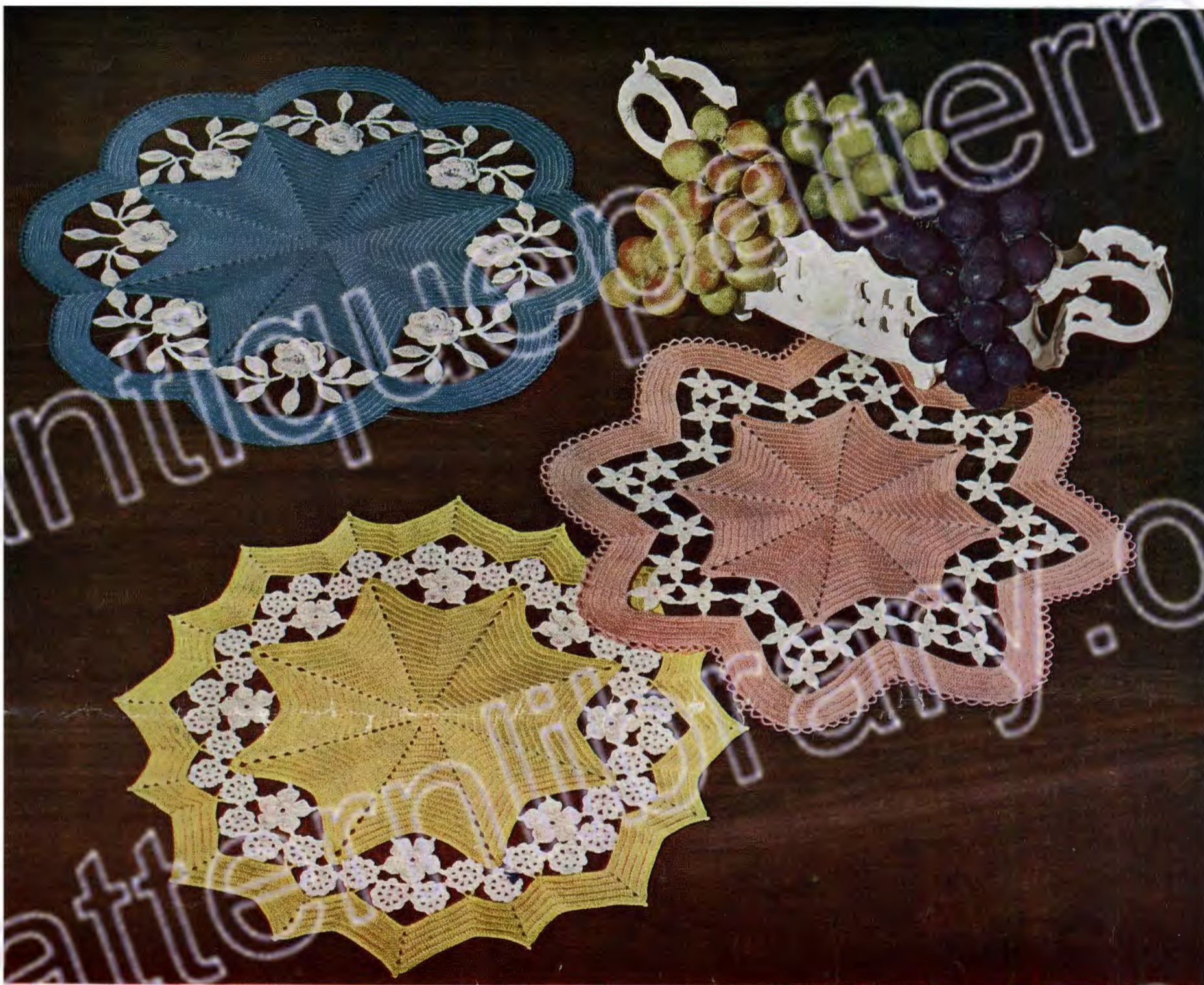
TRIPLET DOILIES — Damask Rose Star