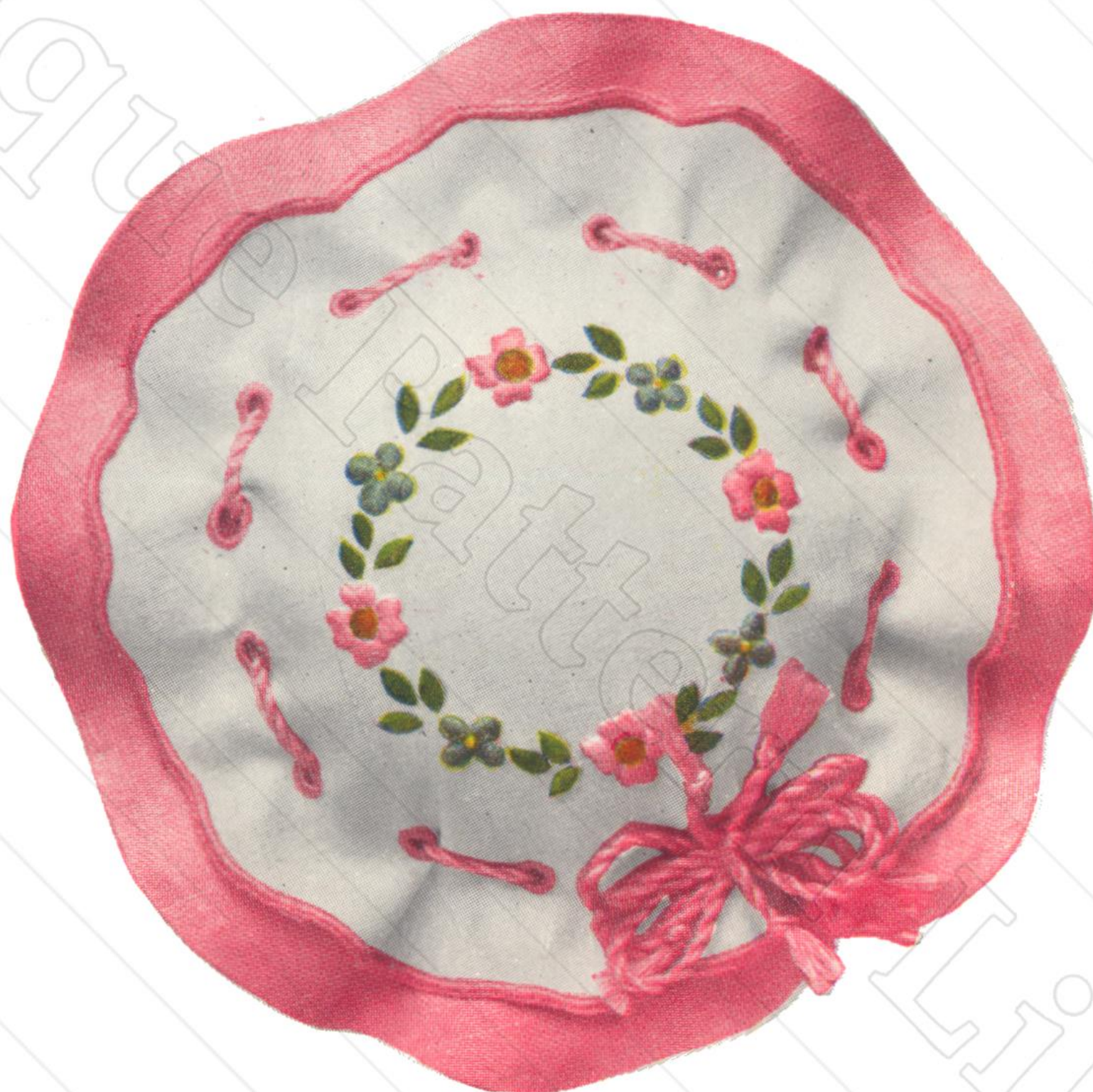
PIN CUSHIONS $2.25

Pin Cushions. Cross-stitch designs on white linen or Aida cloth, finished with cord.