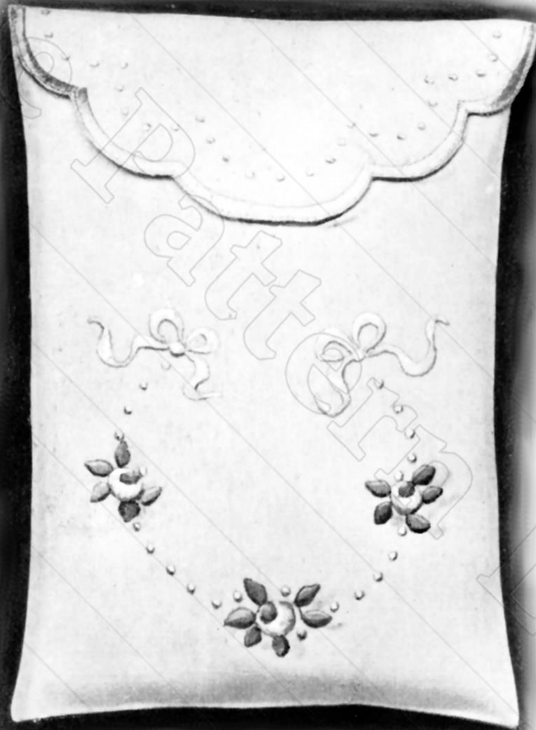
SACHET, 3 x 4 INCHES