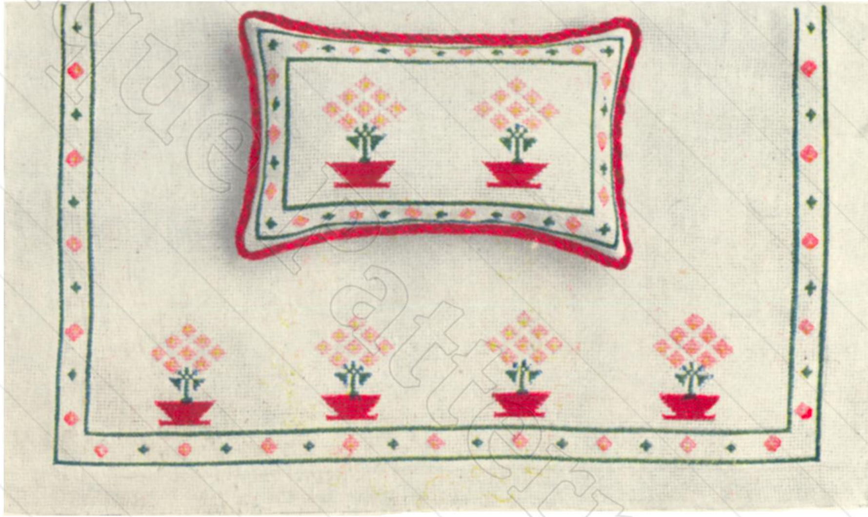
BUREAU-COVER WITH PIN CUSHION TO MATCH

Bureau-covers. White linen, Aida or Java, worked in colors. (See cut)