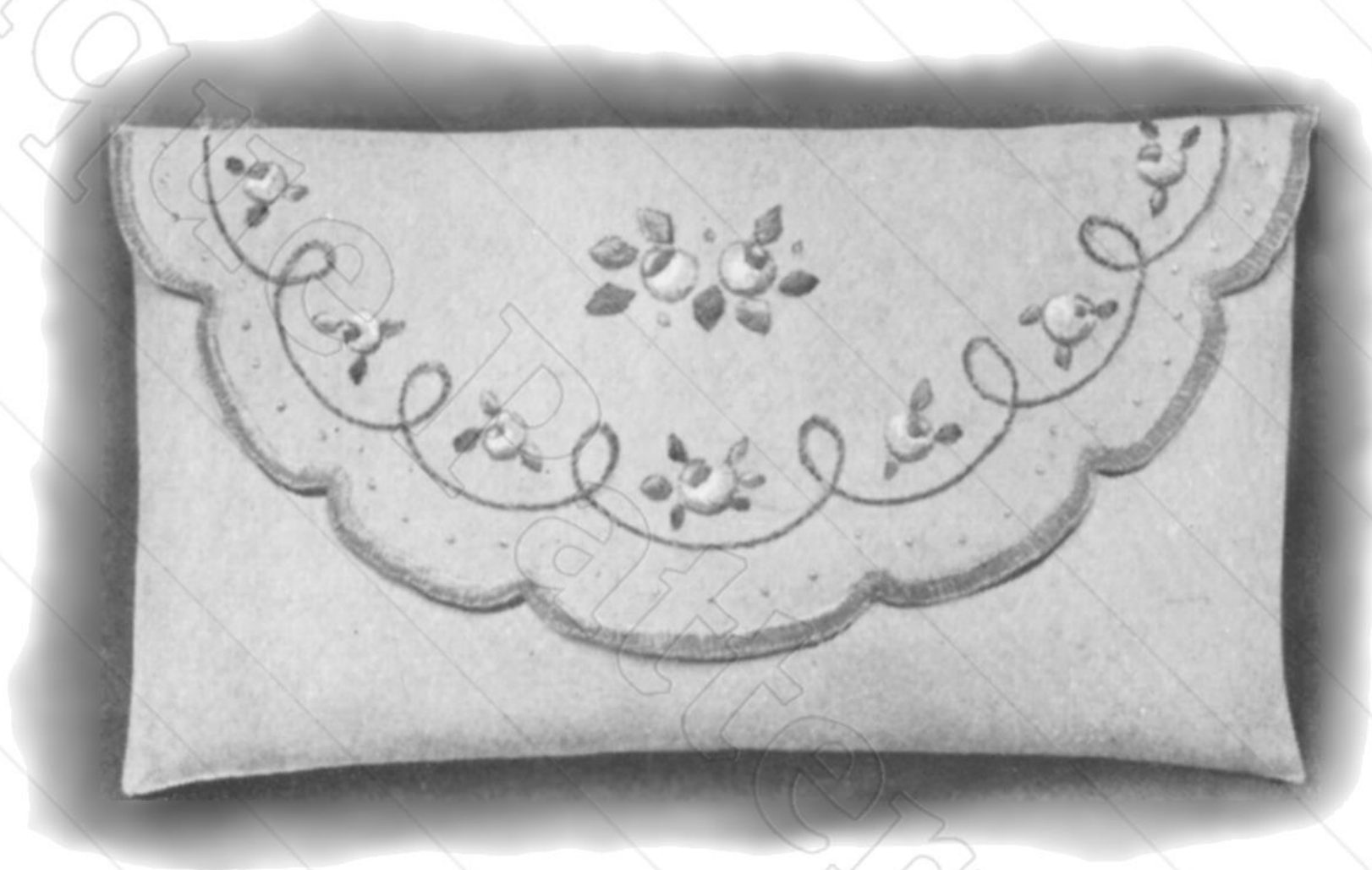
SACHET, ENVELOPE SHAPE, 3 x 5½ INCHES

Sachets. Finest white linen, worked with silks in dainty designs, filled with best powdered orris.